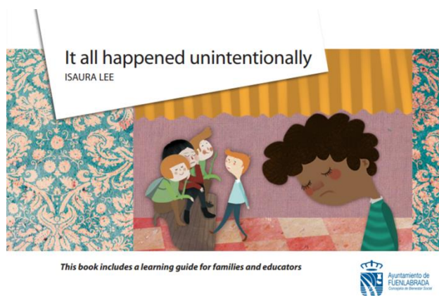
Children's story and learning guide "It all happened unintentionally"