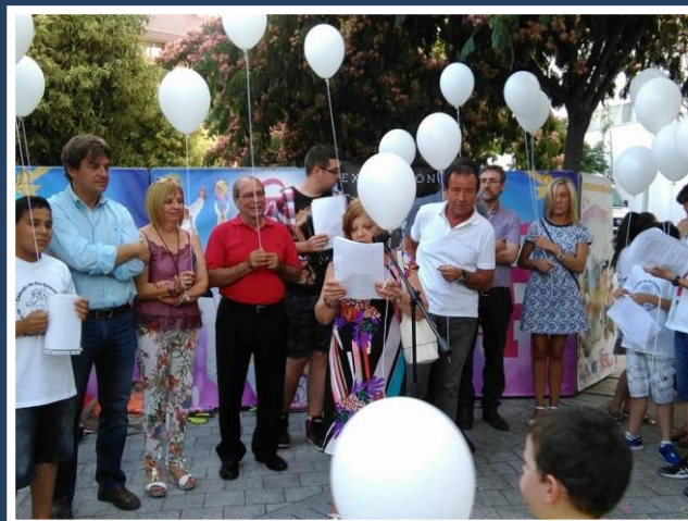
International Day of Human Rights