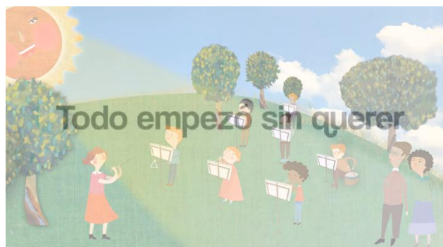
Children's story on video "It all happened unintentionally"