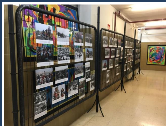
Exhibition "We were also refugees"