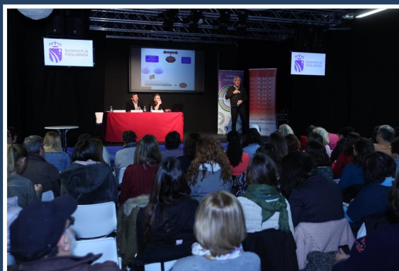
Training days against racial discrimination 2018