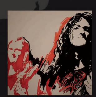
Young Groove Impro Band