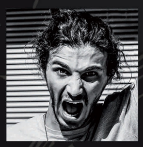
Fotoausstellung von Alves Rasool "IFA" Das Gesicht hinter der Zahl