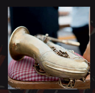
Sägewerks "Haus & Hof" Band